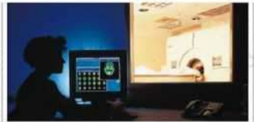
Brain scanner could extract images to be given such as PET scanning pose a risk to privacy?

The new round of structural funds, covering the period 2006-2006, will total EUR225 billion (US$287 billion), including EUR45 billion earmarked for new EU members. The proportion dedicated to research is likely to be compatible with the budget of the commission's 6th Framework programme for research, which will be about EUR16 billion (see below) and the new philosophy an structural funds complements that on the 6th Framework programme, which stresses emphasis on the dissemination and exploitation of results.