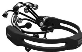
Figure 2. A commercially available EEG-type unidirectional BCI.

As a health-care tool, EEG is used to assess comprehensive brain function; determining the effectiveness of anesthetics, pinpointing the brain region source of seizure, and ascertaining brain death. 18 However, it has certain constraints that make it a relatively imprecise BCI method. Besides the inability for EEG-devices to read most areas of the brain, there is a great amount of operator time investment to train on individual devices to achieve optimal results. Nonetheless, many of the early BCIs are based upon the EEG methodology due to low cost and ease of manufacture. The first commercially available BCIs are based on EEG technology. As of February 2015, EEG interfaces for personal computer use are available for purchase with a cost of less than $500.00 per unit (Figure 2). 19