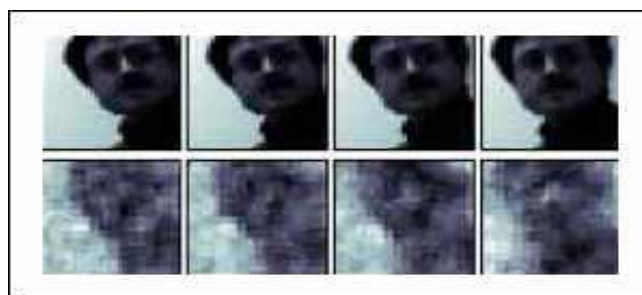
Figure 3. Comparison of true images (top) and images constructed from software-translated neural data from a feline visual cortex.

Stimulation of the visual cortex has been shown to produce artificial sensory stimulus of controlled shape and size in animal studies. 43 Artificial sight through BCI is still in the early research phase and will become more practical as technology allows for greater resolution. Interestingly enough, data can also be read from the visual cortex. In 2011, an interface reading the activity of 177 feline vision associated neurons was able to generate an image based on the stimulus that the animal's visual cortex was receiving from its own sensory organs (Figure 3). 44 Similar success has been achieved through non-invasive methods with humans at the Neuroscience Institute at the University of California. According to Nishimoto, "this modeling framework might also permit reconstruction of dynamic mental content such as continuous natural visual imagery." 45 Furthermore, the study explains that even imagined images or scenes, such as dreams or hallucinations, could be decoded through their BCI method. 46