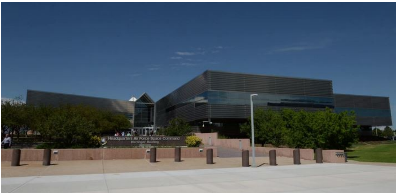
Figure 2. Headquarters - Air Force Space Command, Peterson Air Force Base.

The Air Force Space Command has about 38,000 employees, based at many locations, and has its headquarters in Colorado Springs at Peterson Air Force Base. As previously noted in my ebooks, the satellite tracking frequencies have been scientifically measured at 3600 MHz - 3750 MHz, and the attack frequencies for the Vircators are 3920 MHz – 3935 MHz. These frequencies are confirmed by the FCC frequency allocation table. See my ebook “Targeted Individuals: Technical Information”