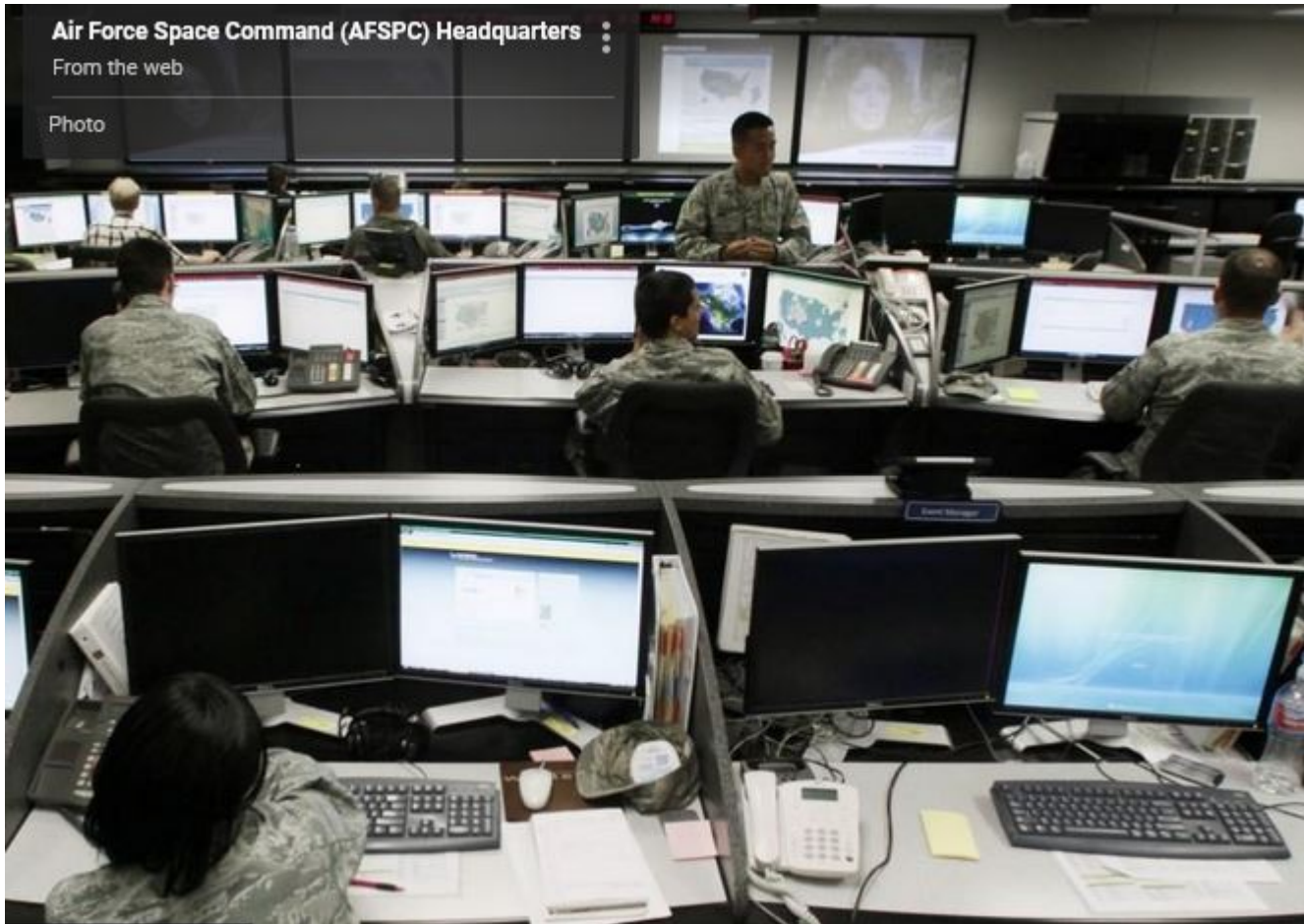
Figure 3. One of the Satellite Control Rooms at Air Force Space Command, Peterson Air Force Base.

So this is how it works: There are hundreds of microwave weapons installed on satellites as “payloads”. The Space Duty Orders come from the 50 th Operational Support Squadron (OSS). This Squadron determines which satellites are available for duty assignments for each day. Some of the satellites will have problems each day, such as malfunctioning software, solar panel problems, software upgrades, etc. This Squadron informs the other units which satellites & weapons are available that day.